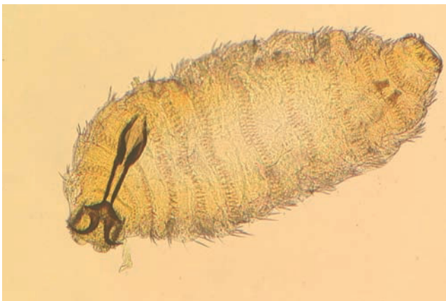
Figure 2 Photograph from an optical microscope ( \times 100 ) showing an Oestrus ovis larva.

of distilled water mixed with eyewash lubricant and prescribed 2 drops every hour. There was no evidence of intraocular inflammation or inflammation of other organs in the eye. The right eye was normal. The patient remained hospitalized and was discharged on the third day given the fact she was no longer displaying symptoms. In her follow-up appointments 3 and 6 weeks after the event, she did not report any symptoms nor were abnormal signs found in the biomicroscopy.