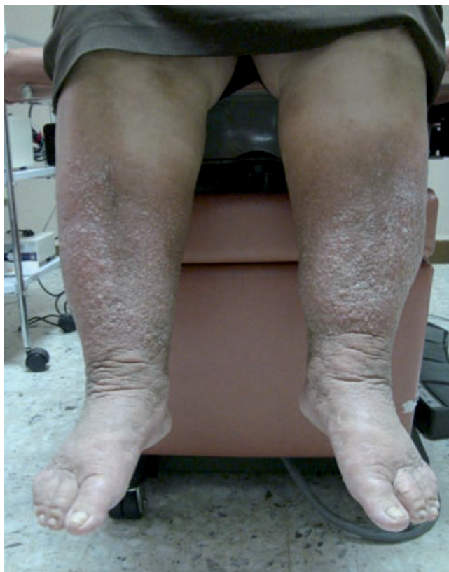
Figure 4 Late-onset primary lymphedema of both lower extremities with the presence of chronic skin changes in a patient of 62 years.

tion, murals (pericytes), cellular proliferation and migration and the specification of blood vessels, venous or lymphatic. 33