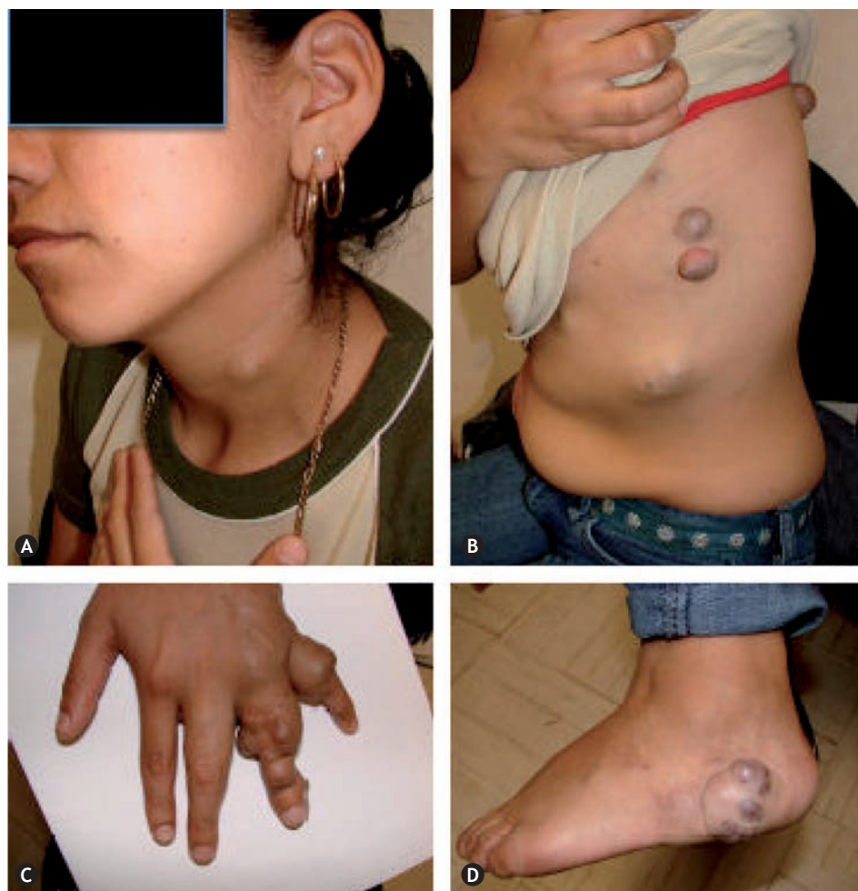
Figure 2 Maffucci syndrome. A: venous malformation (VM) on the lateral side of the neck. B: VM cysts, clustered in the anterior, lateral and posterior of the thorax. C: VM depressible, bluish, in the form of grape bunches which empty upon raising the hand and enchondroma in the phalanges. D: VM on the external side of the left heel.

blood vessels, epithelial connective tissue and neural skin elements, which suggest the existence of somatic mutation in the implicated area. 32 On the other hand, precapillary sphincters in charge of regulating blood flow may have an