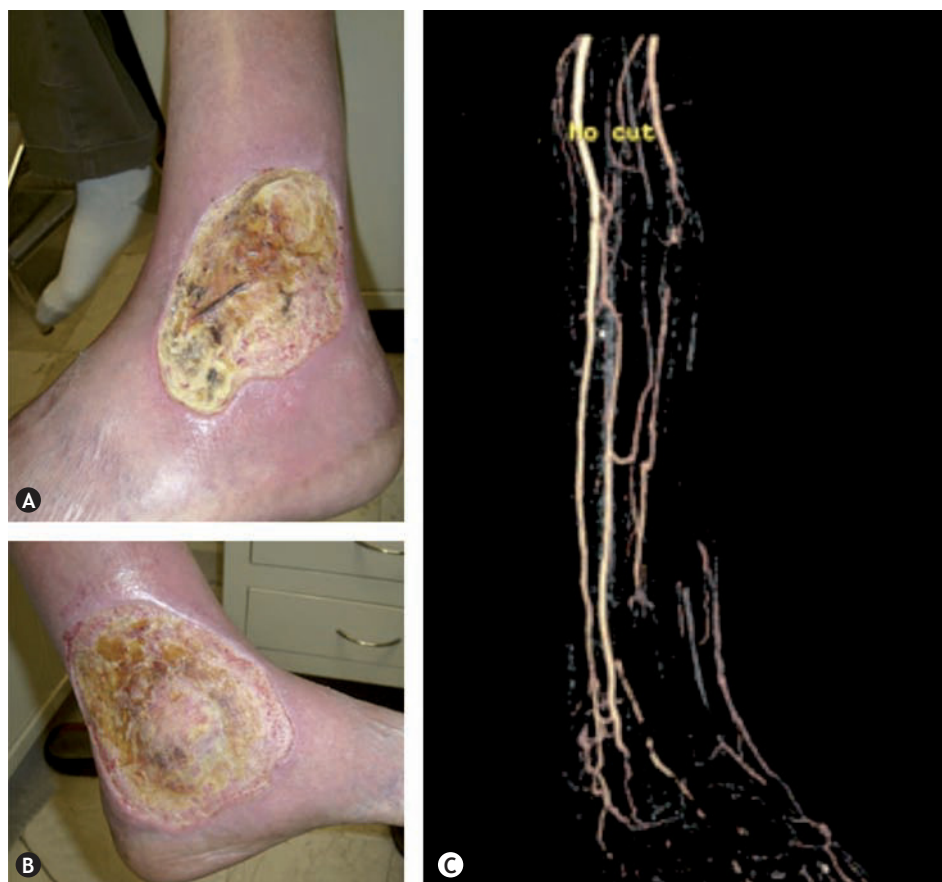
Figure 5 Arterio-venous malformation in a patient of 57 years which caused ulcers in the lower left extremity in the external malleolar (A) and medial (B) region which was accompanied by refractory pain to medical treatment and the diagnosis of AVM was confirmed by ultrasound and angio-MR (C).

sented in a unilateral way, provoking a mass effect causing distortion and asymmetry of facial structures. 44 When they affect the tongue, palate and oropharynx they result in a significant deformity, causing dental malocclusion and if it invades airways it can cause life-threatening lesions. 45 Any part of the digestive tract may be implicated, it can be presented as nodular, sessile or polypoid lesions which provoke chronic bleeding. In troncular venous lesions which manifest as venous dilation or real aneurysms, there is a thrombophilic risk, therefore the presence of venous thrombosis and pulmonary embolism is common. 46,47