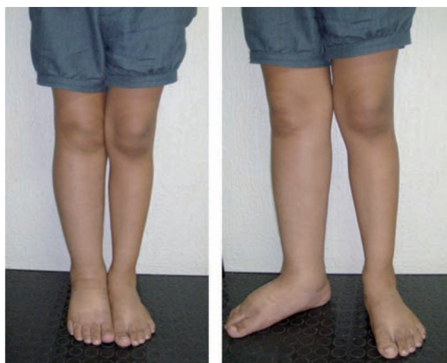
Figure 3 Early-onset primary lymphedema of the right lower extremity in a 10-year-old female patient.

Angiogenesis constitutes a complex process regulated by many factors which lead to the formation of a new functional vascularity, and includes endothelial cell differentia-