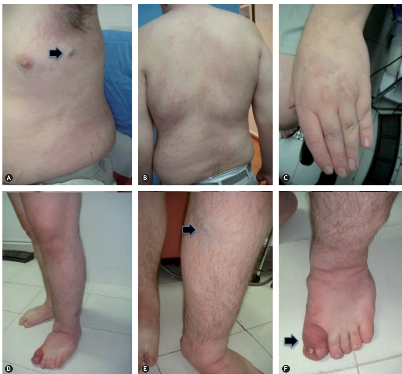
Figure 1 Klippel-Trenaunay syndrome. A: capillary malformation (port-wine stain: diffuse, irregular borders and dim color) on the lateral face of the thorax and abdomen, lymphatic cyst on the axillary region. B: scoliosis and capillary malformation on the back of the chest and abdomen. C: increase in the volume of the fingers secondary to lymphedema. D: hypertrophy and lymphedema of the lower extremities. E: venous malformation in the medial aspect of the upper third of the left leg. F: acute complication of lymphedema: onicocriptosis and cellulitis of the first toe.

Troncular lesions are formed in the late embryonic stage where vascular trunks are being formed, 13 and at the same time are subdivided into obstructive and/or dilated lesions (figure 1). Cells forming this type of lesion have lost the ability to proliferate and are presented as a remnant of fetal vasculature, being displayed as aplastic, hypoplastic, or