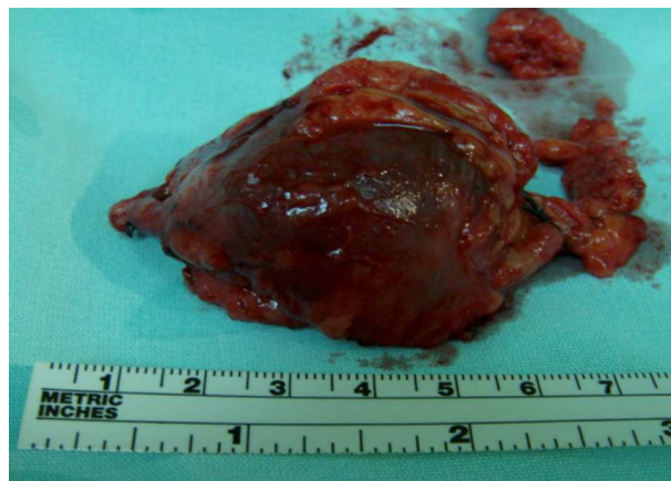
Figure 3 Thrombosed internal saphenous vein venous aneurism.

the vein's diameter is twice as large as the normal diameter, then it is considered to be an aneurysm (the saphenous vein's normal size at the saphenofemoral joint is 3–5 mm, 2–4 mm at the thigh and 1–3 mm at the ankle). 8 Nevertheless, in order to consider it a primary venous aneurysm size is not the only factor considered. It must also be a localized dilation, conformed by three histological layers which constitute the normal venous wall. This could be saccular or