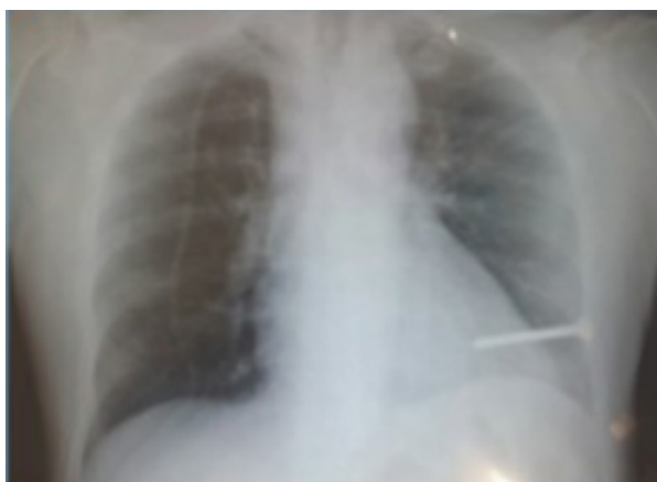
Figure 1 Chest X-ray showing nail inside cardiac silhouette.

The patient was immediately transferred to the OR where he underwent a median sternotomy. The pericardium was opened, obtaining 100 ml of blood. It was evacuated and active bleeding around the nail was observed. The 11.5 cm nail was removed under direct view, and a #18 Foley catheter