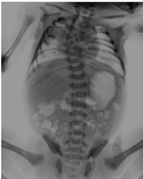
Figure 1 Accentuated scoliosis, absence of 12th right and 11th and 10th left ribs.

Intermediate Care Unit for maternal training and pediatric orthopedic assessment for the planning of costovertebral alteration management. He is released from the hospital on day 7 of his extrauterine life, with a reassessment of the