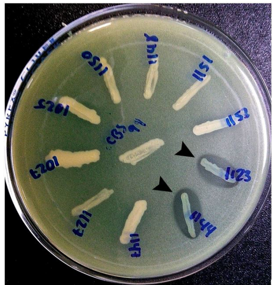
Figure 1. Sample of a killer assay. Strains 1123 and 1144 in the plate (arrowheads) exhibit the killer phenotype.

The screening of killer activity was performed as reported previously (Robledo-Leal et al., 2012), using YEPD-MB agar (0.3% Yeast extract, 0.3% Malt extract, 0.5% Peptone, 2% Glucose, 2% Agar and 0.003% Methylene blue, adjusted to pH 4.5 with 0.1 M citrate-phosphate buffer). Twenty-four-hour-old cultures of the clinical isolates were mixed with the YEPD-MB agar to obtain a final concentration of 1 \times 10^6 cells per mL. After homogenization, media was poured onto Petri plates. Killer strains were streaked as thick smears over the sensitive lawn and replicates were made for incubation at 25°C for up to 72 h. The appearance of an inhibition zone surrounding the killer yeast bordered with a halo of dark-blue-stained cells was considered a positive indication of the presence of killer activity (Figure 1). Once the results were obtained, each assay was repeated for confirmation and reproducibility.