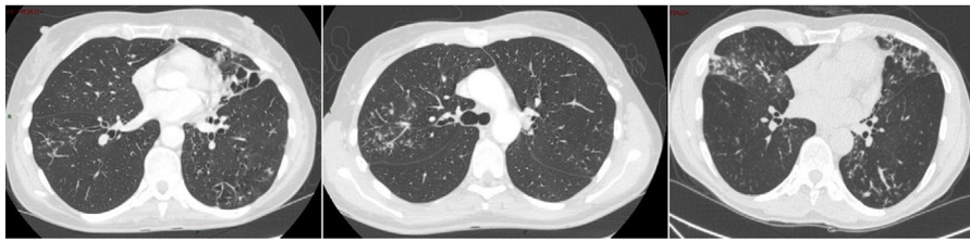
Figure 2 Nodular-bronchiectatic phenotypes of NTM. The CT images (left to right) show severe bronchiectasis in the Lingula in a patient with M. avium lung disease. Tree-in-bud is most easily visible in the right lung and the middle image shows this more clearly in the same patient. The right image shows a bilateral nodular bronchiectatic disease in a gentleman with M. abscessus infected.