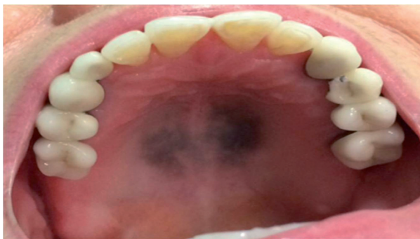
Fig. 1: Clinical aspect of hyperpigmentation of hard palate induced by chloroquine therapy showing a blue-gray pigmented diffuse lesion with irregular borders.

A 60-year-old Mexican woman was referred for evaluation of a diffuse blue-gray pigmentation of the hard palate lasting six months. Her medical history revealed that she had been undergoing treatment with chloroquine diphosphate (150mg/day) for rheumatoid arthritis for 1 year. Clinical examination showed a 4 cm blue-gray pigmented diffuse lesion with irregular borders on the hard palate (Fig. 1). The pigmented area did not blanch