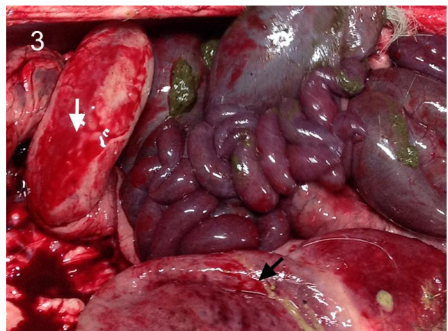
Figure 3. Severe serosal hemorrhages on intestine (white arrow) and forestomach (black arrow).