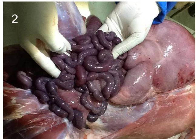
Figure 2. Diffuse dark discoloration of the intestinal serosa.

Laboratory (Pullman, WA) for in situ detection of BTV and EHDV antigens. After extraction of nucleic acids with Trizol from paraffin-embedded tissues, BTV and EHDV were investigated using a real-time PCR (RT-PCR) assay (15). Test results were positive for BTV and negative for EHDV.