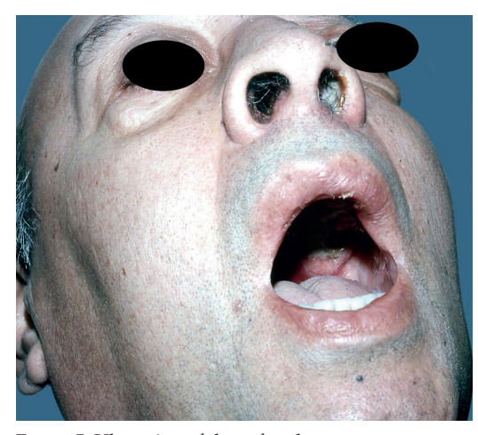
FIGURE 5: Ulceration of the soft palate