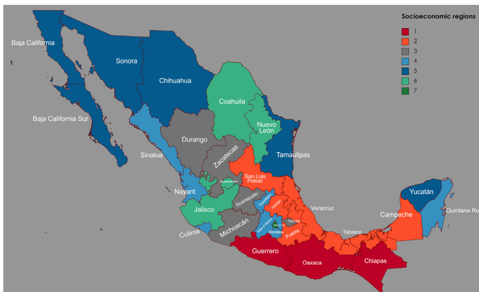
Figure 1. Geographic distribution of the socioeconomic regions of Mexico.

23% by 2050. 8 The consequences of this transition probably will be an increase in prevalence and mortality due to some diseases such as PD. Concerning the prevalence of PD in Mexico, previous studies had reported an overall incidence rate of 37.92/100,000 (incidence density of 9.48/100,000 person-years) for the 2014–2017 period, but when stratified by age, in the ≥ 65 population it was 313.94/100,000. The incidence rate was higher in men than in women (42.22 vs. 34.78/100,000, respectively). 9